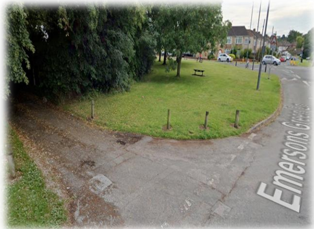
Approach to Vinney Green