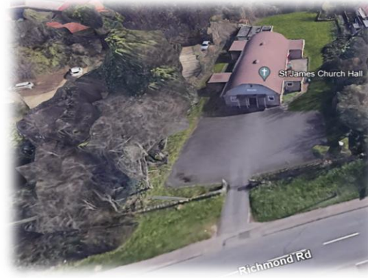
Primary RVP St James Church Hall Richmond Rd, Bristol, BS16 9EZ W3W shadow.slam.salad