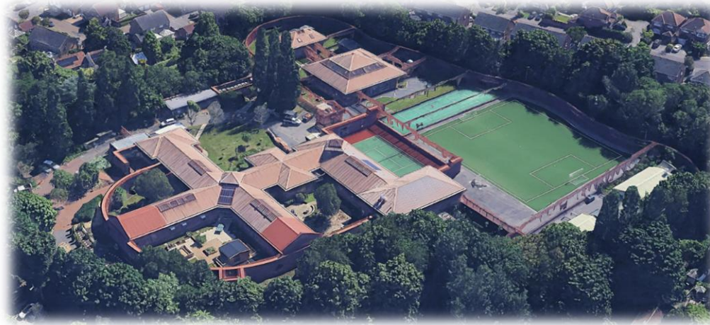
Overview layout of Vinney Green

Address: Vinney Green Secure Childrens Home, Emersons Lane, Emersons Green.BS16 7AA Location W3W moss.fleet.owner