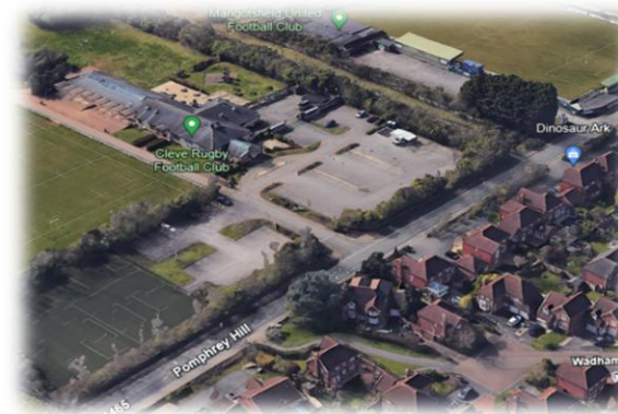
Secondary RVP Cleve Rugby Football Club, Cossham St, Bristol, BS16 9EN W3W slips.homes.sorry Or Mangotsfield Football Club, Cossham St, Bristol, BS26 9EN W3W circle.hello.weeks